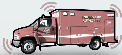
AMBULANCE / FIRE TRUCK