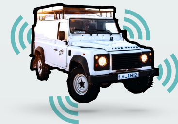
CAR ALARM ON LAUNCH